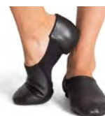
Jazz Shoes, black or tan

For Int/Adv: Same Jazz Shoe listed above or socks, or bare feet.