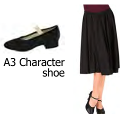
A3 Character shoe